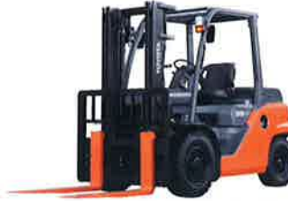
The model shown is 8FD35