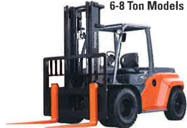
The model shown is 8FD70