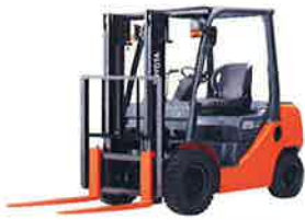
The model shown is 8FD25